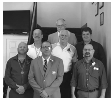
LOOM OFFICERS 2018-2019