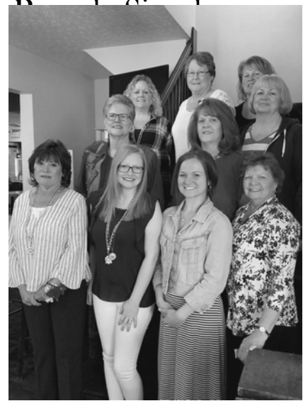
WOTM OFFICERS 2018-2019

Lets make this a great year, and don't forget to volunteer when you get a chance.